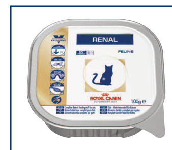
Alutray with Chicken: 100g