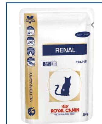
Pouch with Chicken: 100g

Alutray with Chicken Pork and chicken meats, maize flour, fish, fish oil, cellulose fibre, minerals (including zeolite), carrageenan, calcium carbonate, taurine, sunflower oil, DL-methionine, Fructo-Oligo-Saccharides (FOS), trace elements (including chelated trace elements), marigold extract (rich in lutein), vitamins.